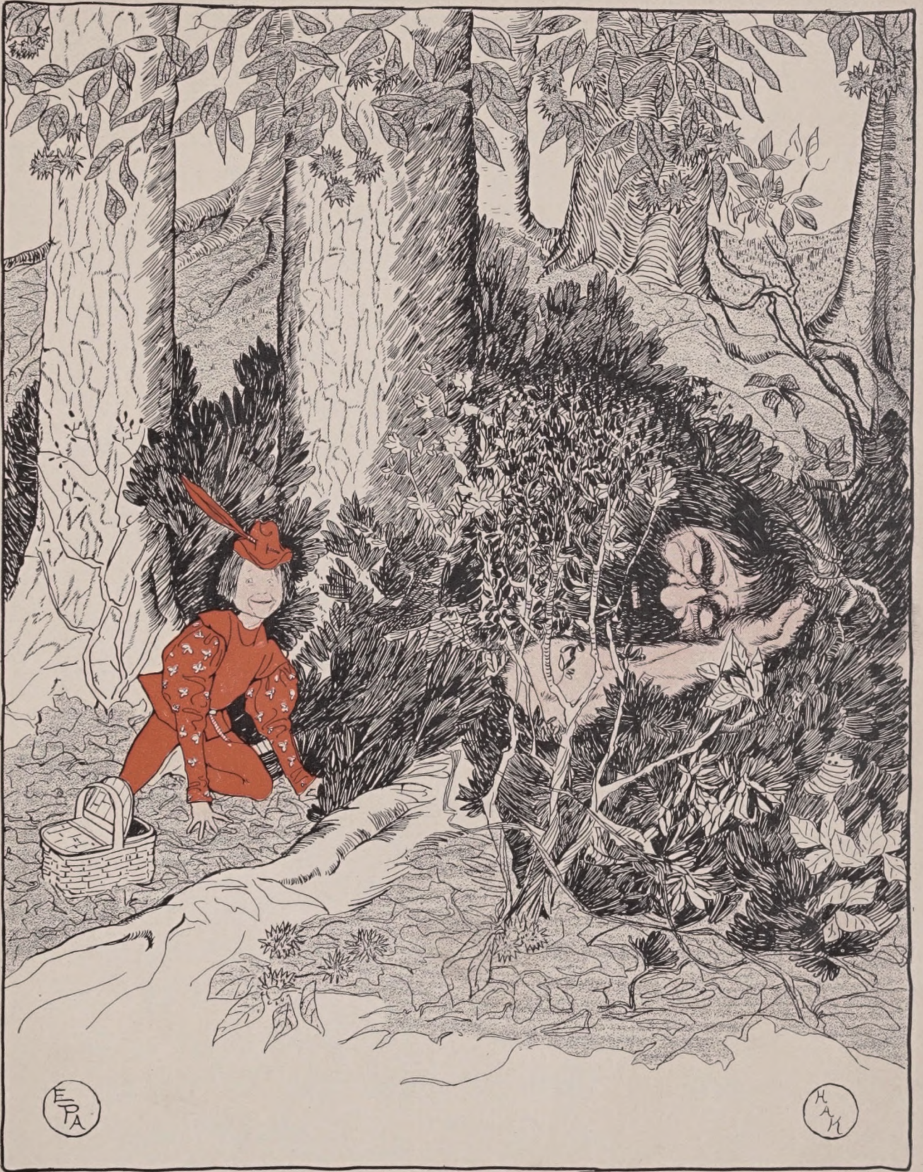
JACK, JUNIOR FINDS A GIANT IN THE WOOD